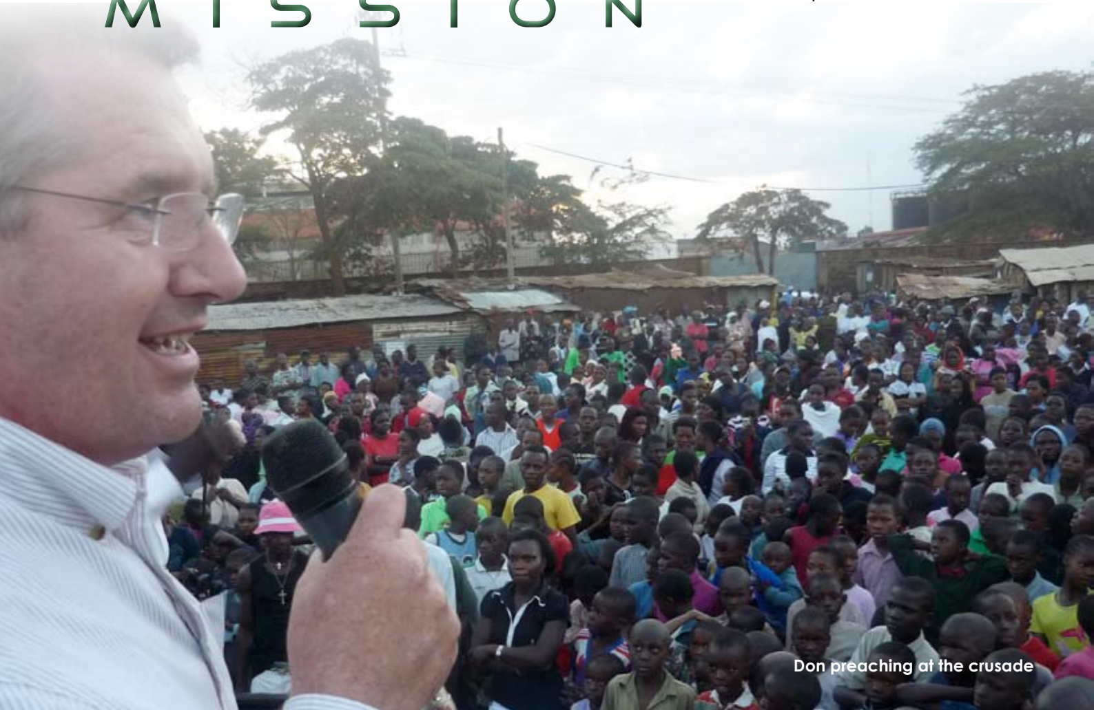
Don preaching at the crusade